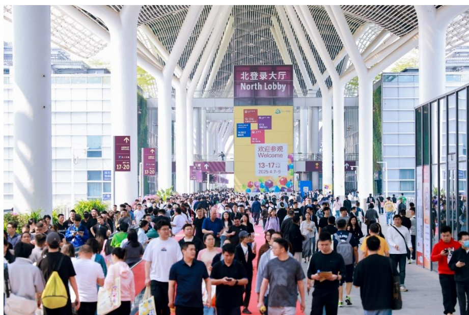
The previous edition saw strong visitor flow from industry exhibitors, buyer delegations and decision-makers at Shenzhen World Exhibition and Convention Center.

As the fairs that signal the start of the sourcing season in South China, Toy & Hobby China, Baby & Stroller China, and Licensing China are well-positioned to set the tone for the market. The three interconnected sectors are experiencing growth on a global scale, particularly in the field of trendy toys and collectibles, along with AI smart toys which are projected to expand at a CAGR of 14.6% 1 . In view of these trends, Toy & Hobby China will launch its AI Smart Toy Area in Hall 11 this year, complementing the Trendy Toys & Collectibles Zone introduced in 2025. With the Toy Award and Hobby Award showcases, business matching and many more fringe events on offer, the restructured fairground will be a dynamic hub of inspiration and collaboration, leveraging the vast Chinese market to drive business expansion.